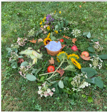
Altar from the August 20 Wild Church Gathering