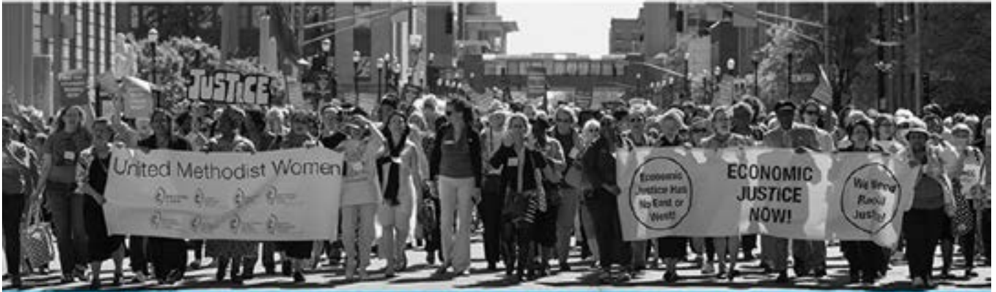
United Methodist Women Assembly May 18-20, 2018 • Greater Columbus Convention Center

The 19 th quadrennial Assembly of United Methodist Women will be May 18 – 20, 2018 in Columbus, OH. It is quite an honor for West Ohio Conference to be the host conference. The event will mark the official celebration of the organization’s 150 th anniversary and will also be a return to the location of the first Assembly in 1942.