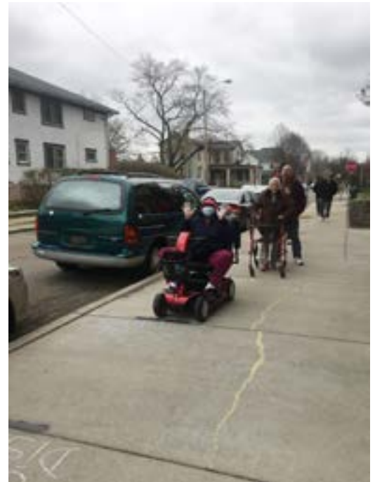
Friends in line for Tuesday Lunch